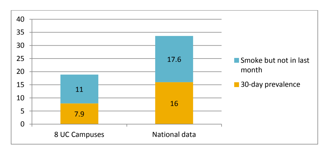
Figure 2 Smoking prevalence among UC students compared to National Average

National average data from MMWR, 9/30/11.